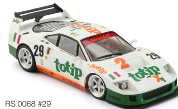
RS 0068 #29 Strandell/Obermaier Racing 24H Le Mans 1994