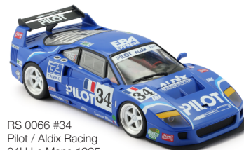
RS 0066 #34 Pilot / Aldix Racing 24H Le Mans 1995