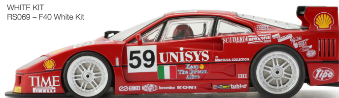
WHITE KIT RS069 - F40 White Kit